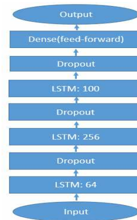
Fig. 2 :Stacked LSTM Network architecture

To train LSTM model in temporal event detection algorithm, collecting social data in time without disaster is required. In our case, earthquake detection was considered for performance so we used discrete data before or long time later specified earthquake. We should make sure that there is no disaster in collecting data for training. Stacked LSTM based prediction model was implemented with multiple recurrent LSTM layers as shown in Figure 4.